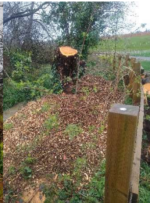
Bark on bank