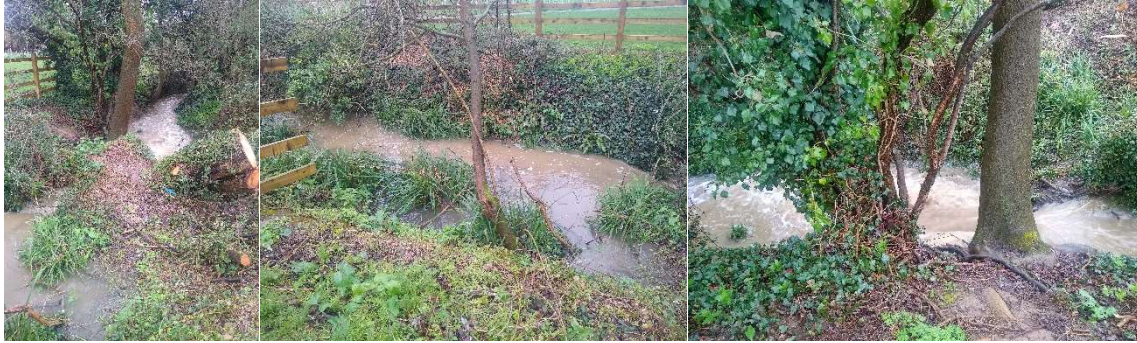
Root ball blocking water flow