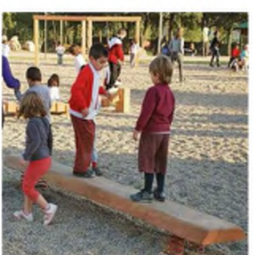
B Timber Play/Richter Spielgerate 'Totter Beam' Product ref: 6.05000