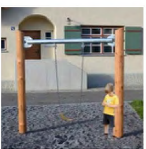
C Timber Play/Richter Spielgerate 'Toddler's Swing Special' Product ref: 6.12002