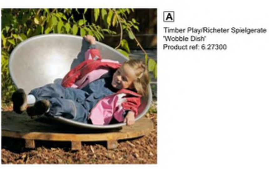
A Timber Play/Richter Spielgerate 'Wobble Dist' Product ref: 6.27300